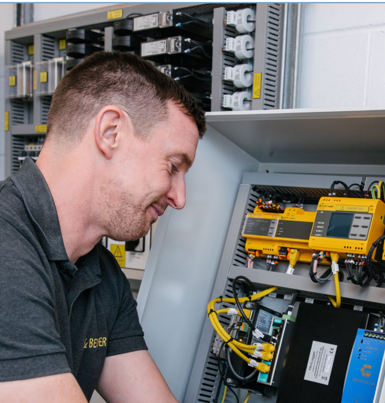
Rail signal power monitoring