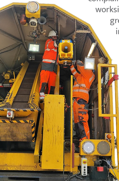
Left image: Warning devices can be installed directly on the construction machines which places the warning signal exactly where the work is carried out

In addition, we are continually working on further innovations to make securing worksites even easier, more cost effective and better for all involved. It will thus be possible to equip railroad machines with a miniature device, the