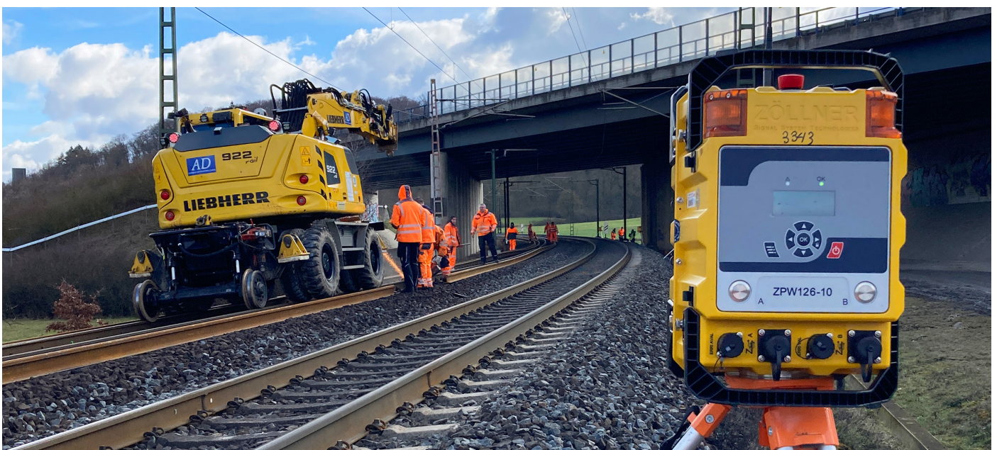
The ZÖLLNER Mobile Radio Warning System consists of light-weight components installed easily at the worksite. The system can be flexibly adjusted using more or fewer warning devices depending on the works carried out, the progress of work and surrounding noise

Until now, it has been customary to secure track renewal worksites or sites with heavy machines by placing automatic track warning systems along the track at regular intervals.