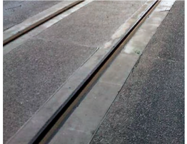
Typical Embedded Track