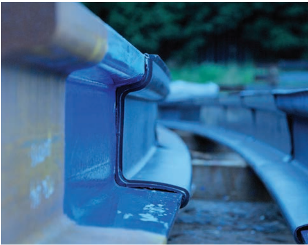
Vector™ Assembled Embedded Rail