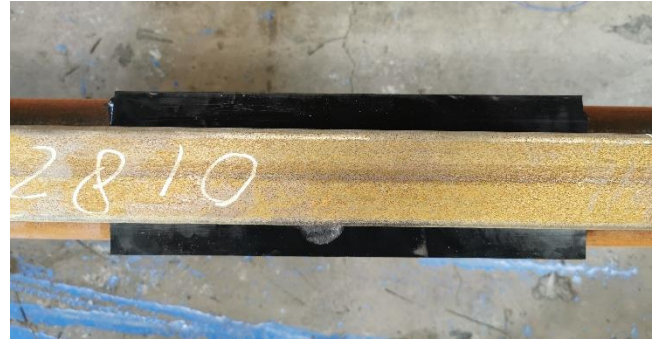
300mm Leniter Rail Dampers

By using an easy to install and robust 'fit-and-forget' material solution, costs are minimised due to decreased downtime and maintenance.