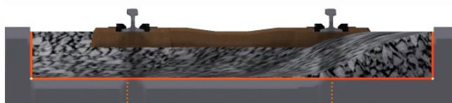
Leniter Ballast Mat shown in orange

Actual ballast mats are black/grey in colour