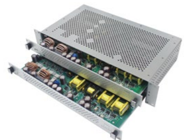
DC/DC CONVERTER, MULTIPLE REDUNDANT OUTPUT RAILWAY SIGNALING (ERTMS)