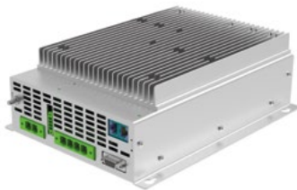
2KW 3PH DC/AC INVERTER, PARALLELIZABLE UP TO 4 UNITS RAILWAY INTEGRATED TRACK MANOEUVRING SYSTEM

Premium PSU is a trusted technological partner