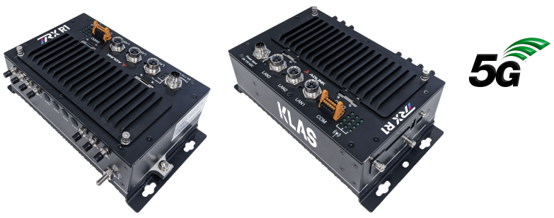
Figure: TRX R1 top and bottom views

Klas, in partnership with Adlink, solves these challenges with TRX R1 and the KlasOS Keel lightweight operating system. Furthermore, with Blackrock Ansible automation and monitoring platform from Klas, operators can easily maintain and secure TRX R1 gateways at scale.