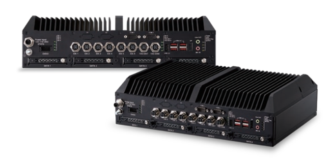
Harness AI technologies and deploy smart, rugged, real-time graphics/video applications vital to modern railway operations

When installed in a specialized inspection railcar, AVA-7200 models can process images of vital wayside equipment, identify faulty equipment, and disseminate maintenance alerts while travelling at high speeds.