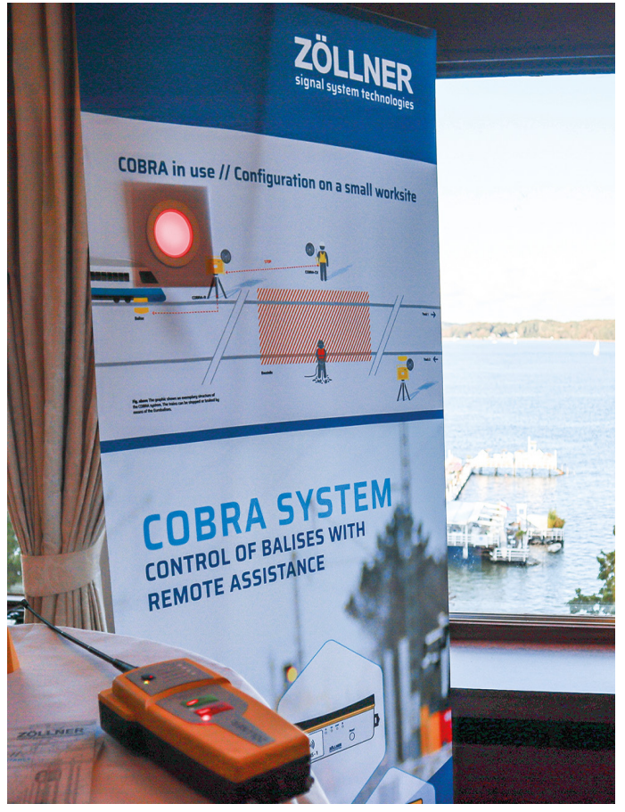
The exhibition offered hands-on opportunities to get to know the ZÖLLNER product portfolio

Our ZCloud (ZÖLLNER Cloud), for example, was developed based on feedback from our customers to develop a tool that helps them with their everyday challenges when planning and executing the safety measures for track worksites. It revolutionises the way our customers can manage their warning systems: