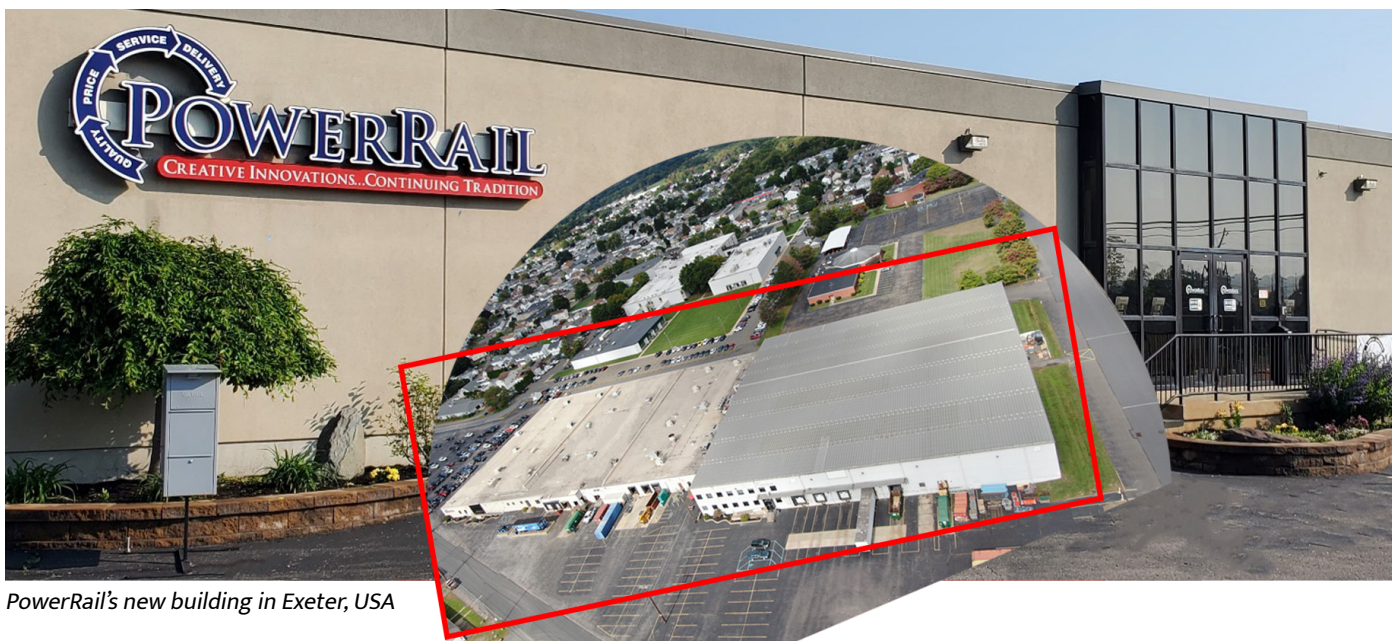
PowerRail's new building in Exeter, USA

division – PowerRail Marine. With the additional companies, joint venture locations, and strong vendor relationships, the PowerRail family of companies offers a true ‘one-stop-shop’ experience.