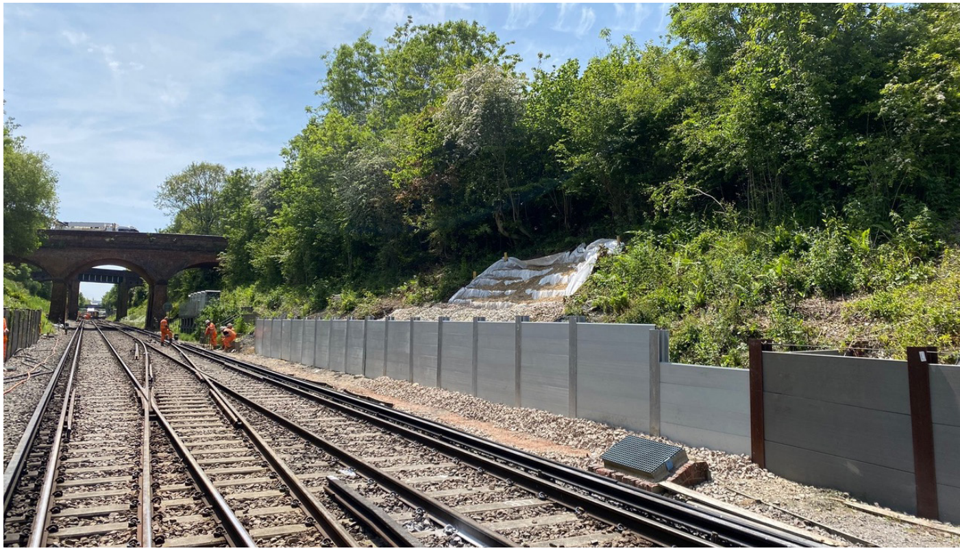
Composite ballast boards from CCS being installed on site

CS is proud to introduce its lightweight, impact-absorbent 'composite ballast boards' – ideal for protecting railway lines and trackside facilities on embankments from the likes of rockfall or snowslide.