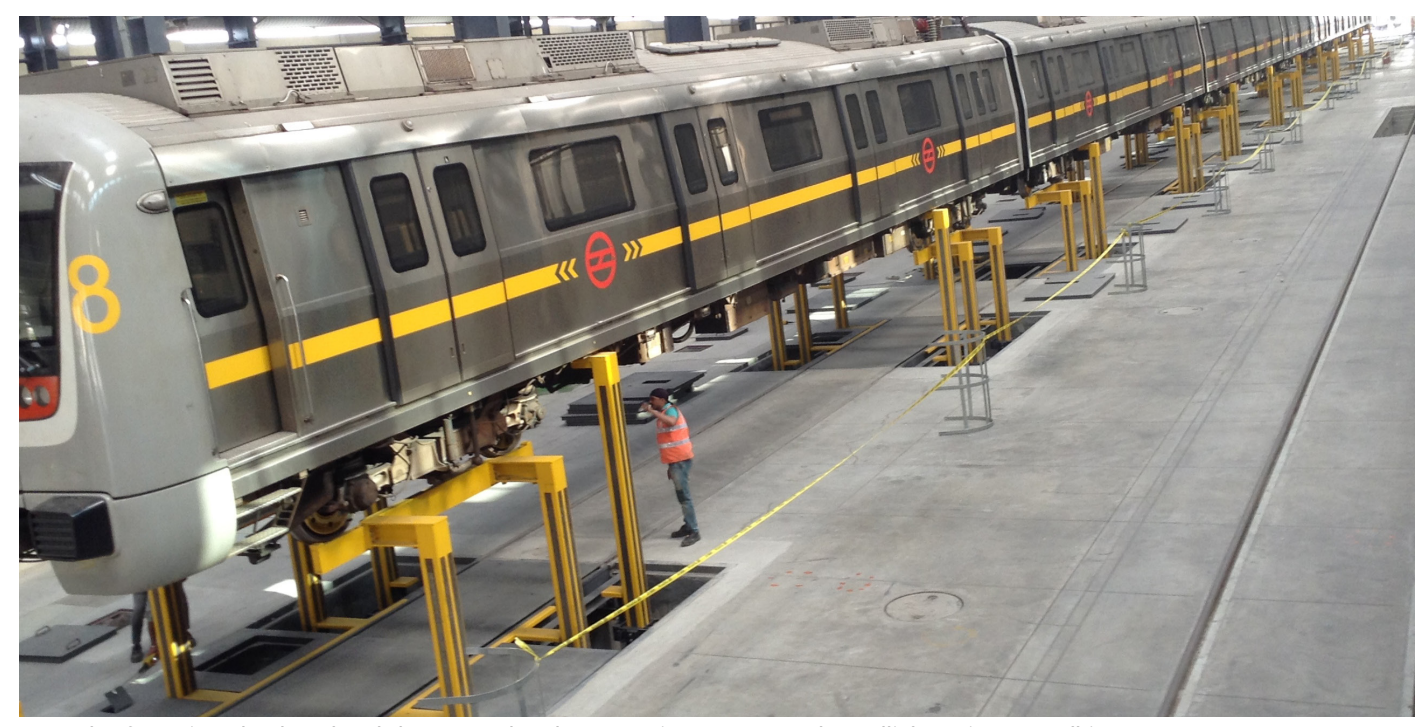
Example of a project that has already been completed: an 8-carriage system at the Badli depot in New Delhi