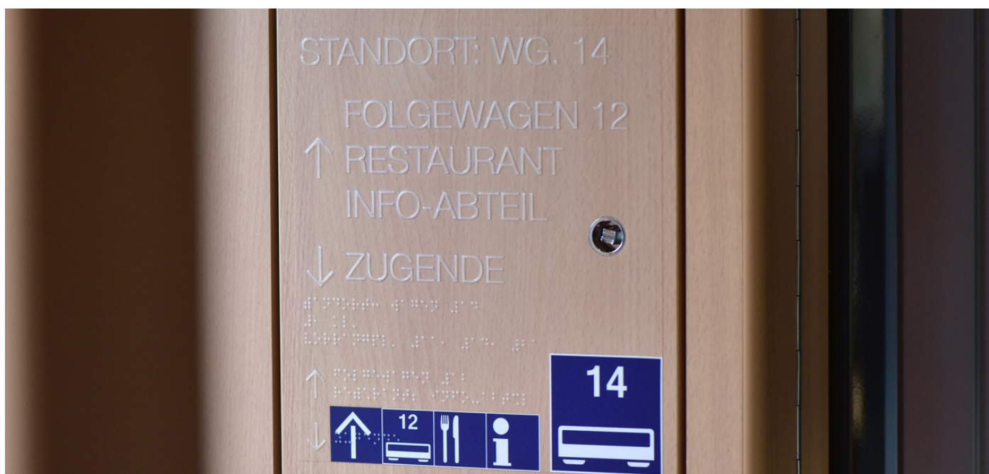
Tactile information system for better orientation in the German ICE 4