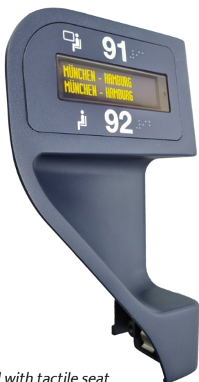
Grip shell with tactile seat numbering and braille

users years ago and implemented an accessible guidance system in its vehicles. If you take a look at the latest ICE models, for example, you'll see that the relevant passenger information isn't just conveyed