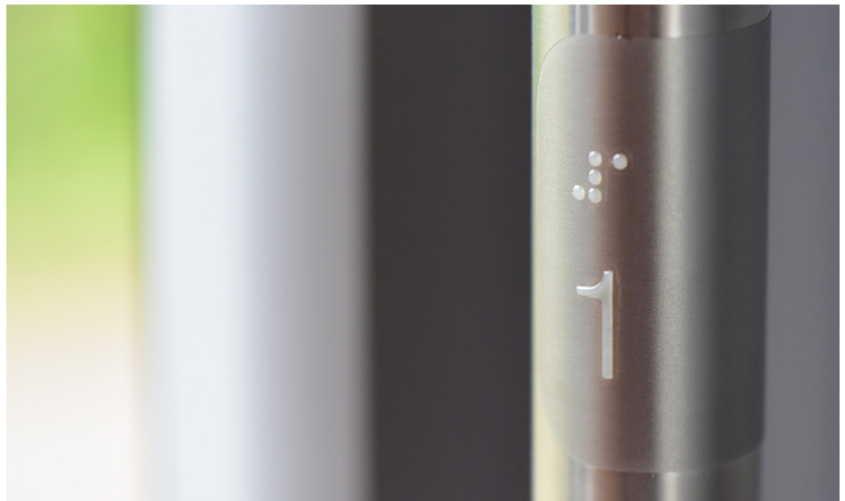
Handrail equipped with tactile number and braille

In close co-operation with visual impairment associations and the responsible specialist departments, it was possible with the Trifol® SBG product range to develop a