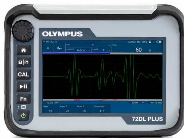
Olympus 72DL PLUS

Historically, most precision ultrasonic thickness gauges have been limited to a maximum of ~20MHz frequency and to a corresponding minimum thickness capability of ~0.005 inches (0.125mm). However, improvements to technology have allowed increasing frequencies to be used in ultrasonic thickness gauges. For instance, the 72DL PLUS gauge drives frequencies up to 125MHz to measure ultra-thin materials – as low as 0.001 inches (0.025mm).