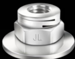
LANFRANCO'S ERM SELF-LOCKING NUT