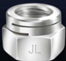
LANFRANCO'S ESL SELF-LOCKING NUT