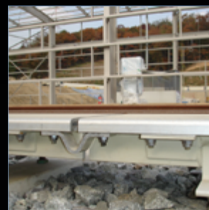
3 RD RAIL CONNEXION