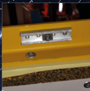
TALGO FASTENING OF FRAME BODY