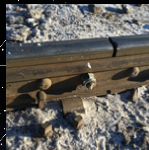
AVAILABLE FOR ANY STANDARD