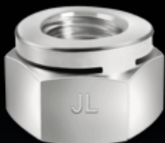
LANFRANCO'S THU SELF-LOCKING NUT