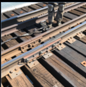
RAIL JOINT BAR