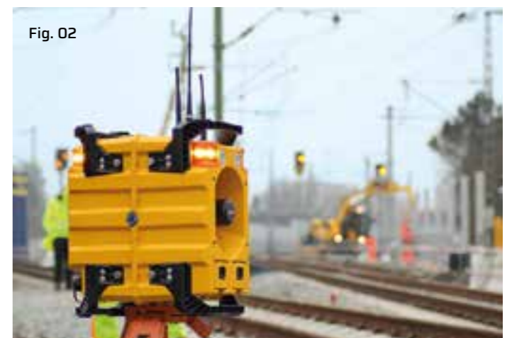
Fig. 01 Fixed data and transparent balises on an ETCS line section