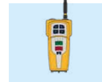
02 Switching on the COBRA-CU control unit Deactivate the RFID cards that are not in use.