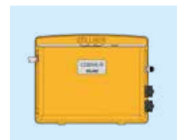
03 Switching on the COBRA-R receiver The system is now ready for operation.