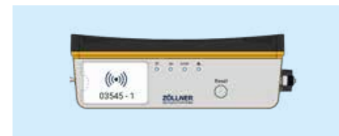
01 Starting the system Insert the RFID card into the COBRA-R receiver.