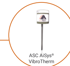
ASC AiSys® VibroTherm