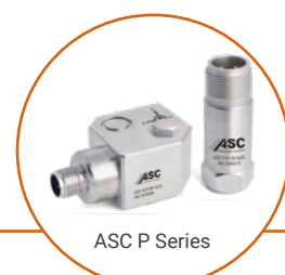
ASC P Series