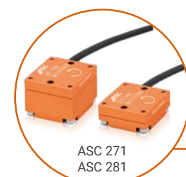
ASC 271 ASC 281