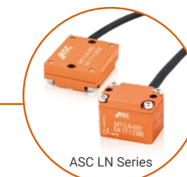
ASC LN Series