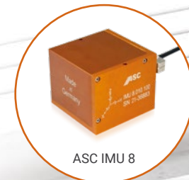
ASC IMU 8