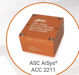
ASC AiSys® ACC 2211