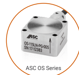
ASC OS Series