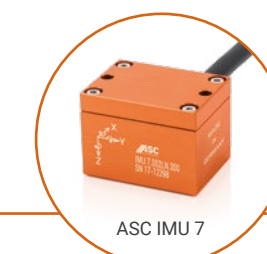
ASC IMU 7