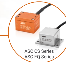
ASC CS Series ASC EQ Series