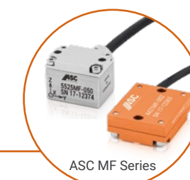
ASC MF Series