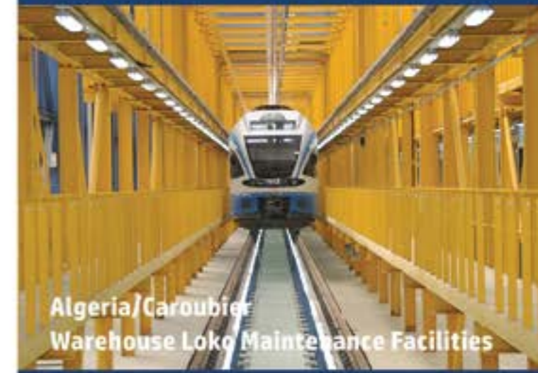
Algeria/Caroubier Warehouse Loko Maintenance Facilities