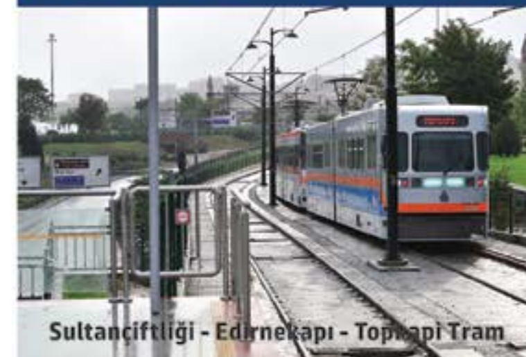
Sultançiftliği - Edirnekapı - Topkapı Tram