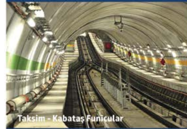
Taksim - Kabataş Funicular