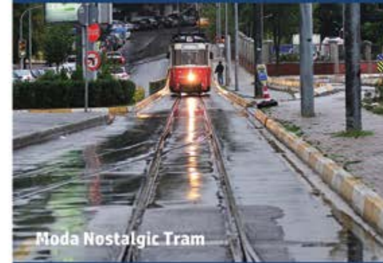
Moda Nostalgic Tram