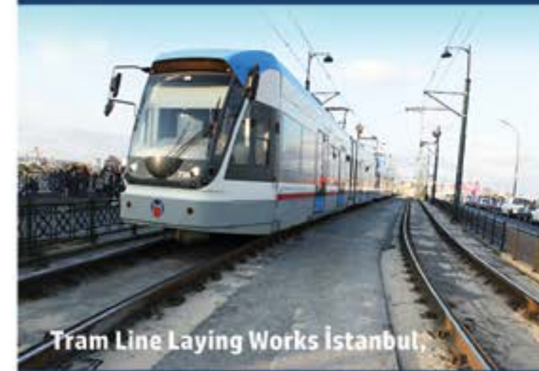
Tram Line Laying Works İstanbul,