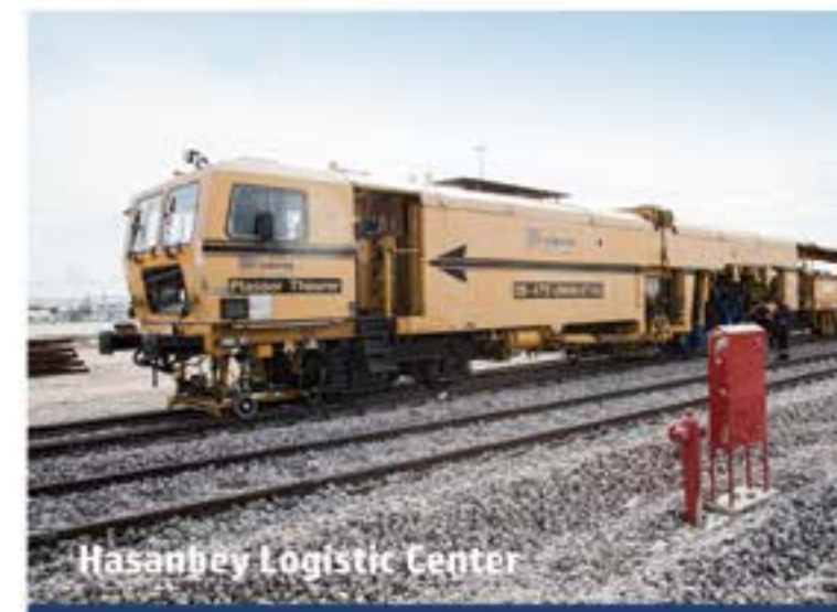
Hasanbey Logistic Center

CONSTRUCTION OF ADLIYE TRAM LINE AND IMPROVEMENT OF CURRENT CAMPUS LINE 2013