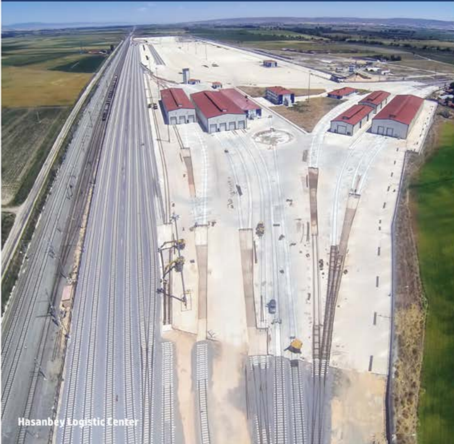
Hasanebey Logistic Center

İstanbul Light Metro İstanbul, 1986 – 1994