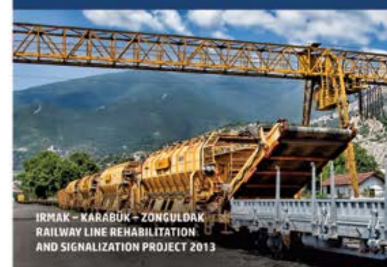
IRMAK – KARABÜK – ZONGULDAK RAILWAY LINE REHABILITATION AND SIGNALIZATION PROJECT 2013