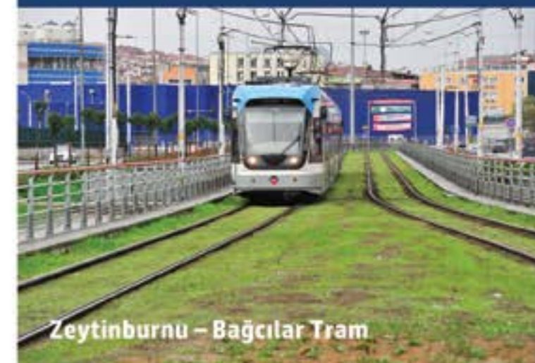
Zeytinburnu – Bağcılar Tram