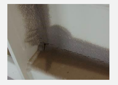
Image 1: Cracks appeared, over time, in the competitor product