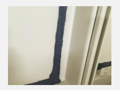
Image 2: Application of Henkel product TEROSON WT 218 FR - 200. Even spray pattern, no overspray, non-saa material.