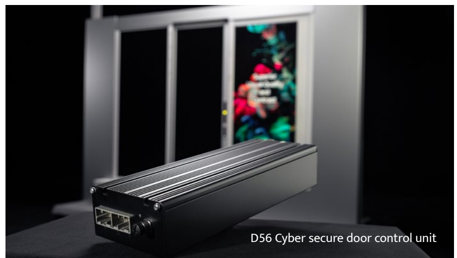
D56 Cyber secure door control unit