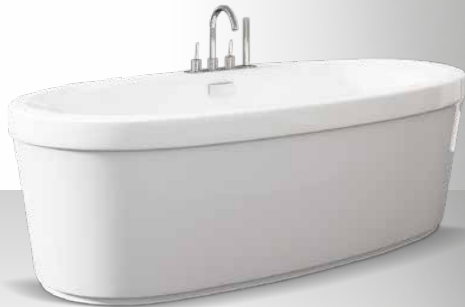
Brooke Reveal | mirolin

DE | Diese Branche hat ganz besondere Anforderungen an die Endprodukte. Hochglänzend, chemikalienbeständig, schlagfest und vieles mehr. senosan® Platten zum Thermoformen erfüllen diese Anforderungen und Aufgabenstellungen mühelos. Nicht umsonst steigen und stiegen die großen Hersteller auf senosan® als Grundmaterial um.