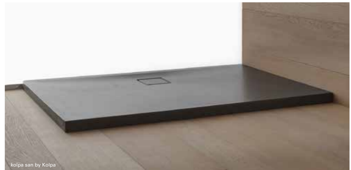
kolpa san by Kolpa