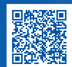
Photo credits: Page 1) Background: Who is Danny/Shutterstock Railway: Denis Belitsky/Shutterstock// Page 2) zhu difeng/Shutterstock Page 4) Ilkuni/Shutterstock

Phone.: +49 (0)351 8837-0 Fax: +49 (0)351 8837-6312 E-Mail: sales@ima-dresden.de