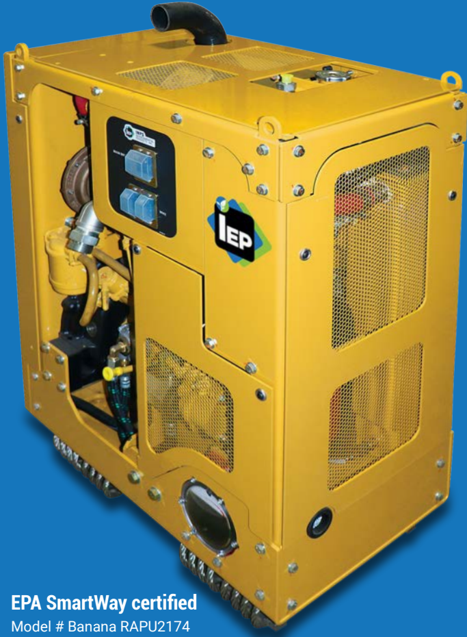
EPA SmartWay certified Model # Banana RAPU2174