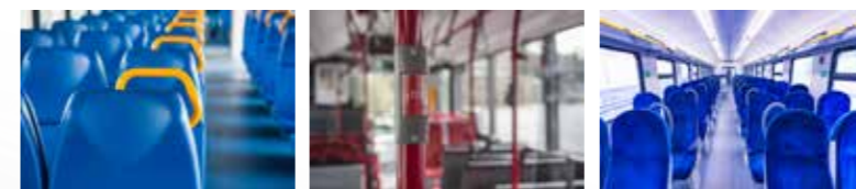
Interior coatings Anti-graffiti