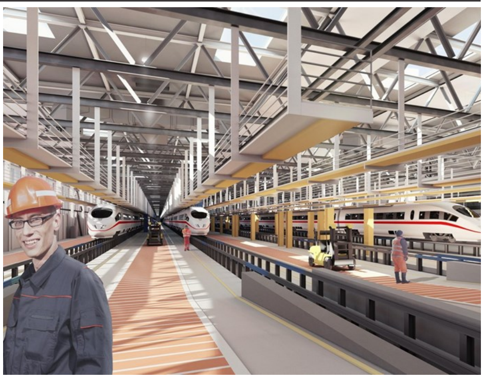
Service Hall with 4 Elevated Service Tracks