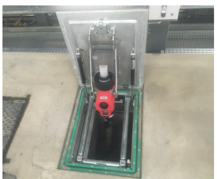
Wastewater Pit with Roediger Suction Pistol

Aqseptence Group GmbH Vacuum Technology Systems