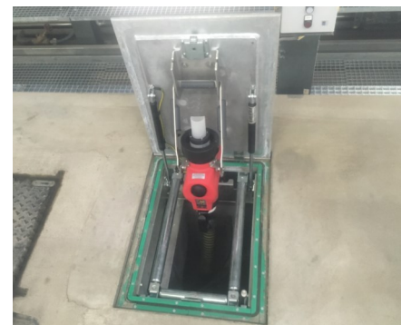
Wastewater Pit with Roediger Suction Pistol