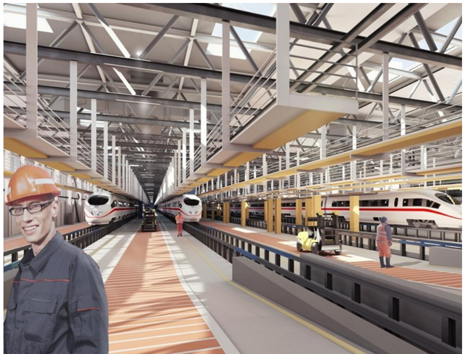
Service Hall with 4 Elevated Service Tracks