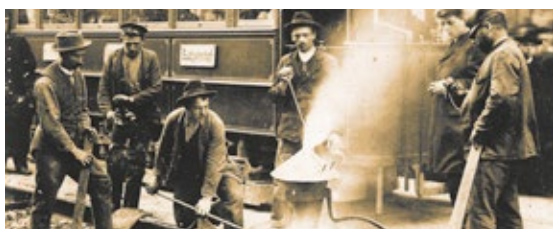
THERMIT ® welding in Graz, before 1914