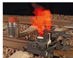
THERMIT ® welding in 2016