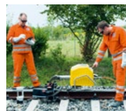
Digital construction site