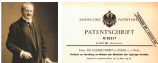
Prof. Hans Goldschmidt Imperial patent no. 96317