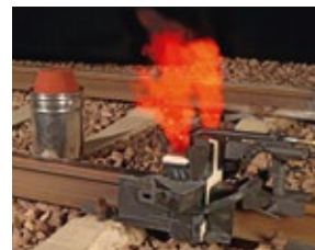
THERMIT® welding in 2016