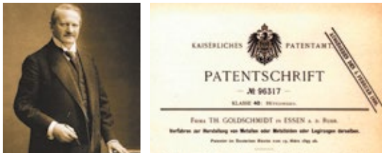
Prof. Hans Goldschmidt Imperial patent no. 96317