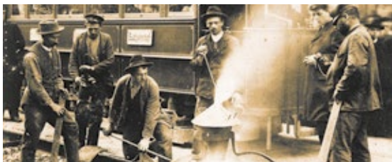
THERMIT® welding in Graz, before 1914