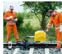
Digital construction site