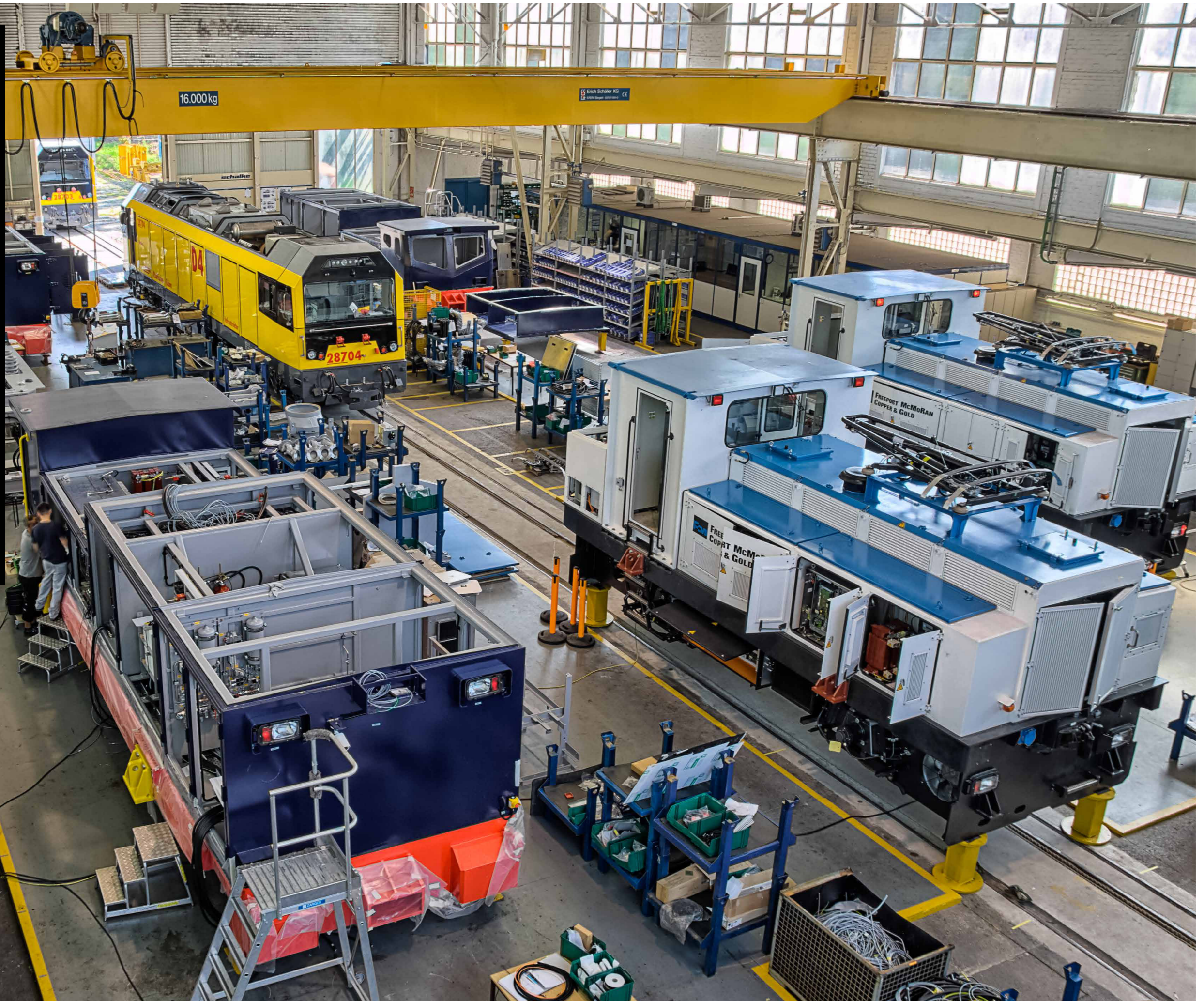
Working to capacity: various types of locomotive are built simultaneously in the Schalke assembly building.

Just the beginning of a long-term relationship – when a locomotive leaves the Schalke manufacturing plant, it signifies the beginning of its working life with the customer. However, the engineers and technicians at Schalke accompany the locomotive throughout its entire life cycle. Servicing, maintenance and useful updates are integral parts of the comprehensive after-sales service Schalke provides.