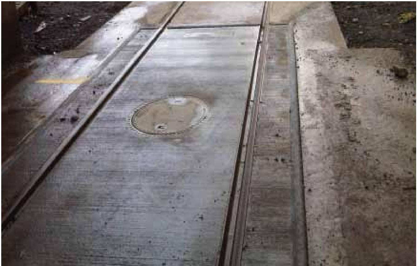
Completed installation of new rail weigh bridge

The final system design was for the supply of three in-ground weigh platforms, measuring 5m x 3m and 6m x 3m and 5m x 3m. Each platform was fitted with 4 load cells per platform, giving an overall length of 16 meters and was controlled and monitored using the Schenck Process Disobox and Disomat system controller. These units enable the facility to switch between each platforms and measure individual weight measurement or the total weight.