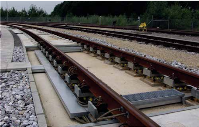
Photo 3: Measuring track curve at Siemens AG, test center PCW Wildenrath

calculated. Only the level of the measurement track and the measurement uncertainty of the force measuring device were verified by means of a reference load cell. This was done without consideration of the vehicle influence, i.e. the interplay between the measuring system and the vehicle system. Other influences caused by the operator, weather, temperature, track configuration and so on were also not taken into account. The variations within several series of measurements (reproducibility measurements) were correspondingly high, not explainable, and unsatisfactory.