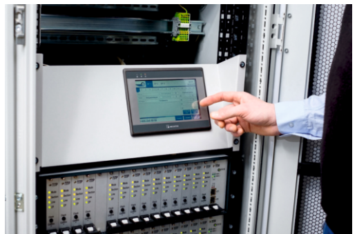
Tower equipment Case of the evaluation block (KBR)

ESSO-M is integrated into any existing signalling systems both in new construction as well as in the modernization and repair.