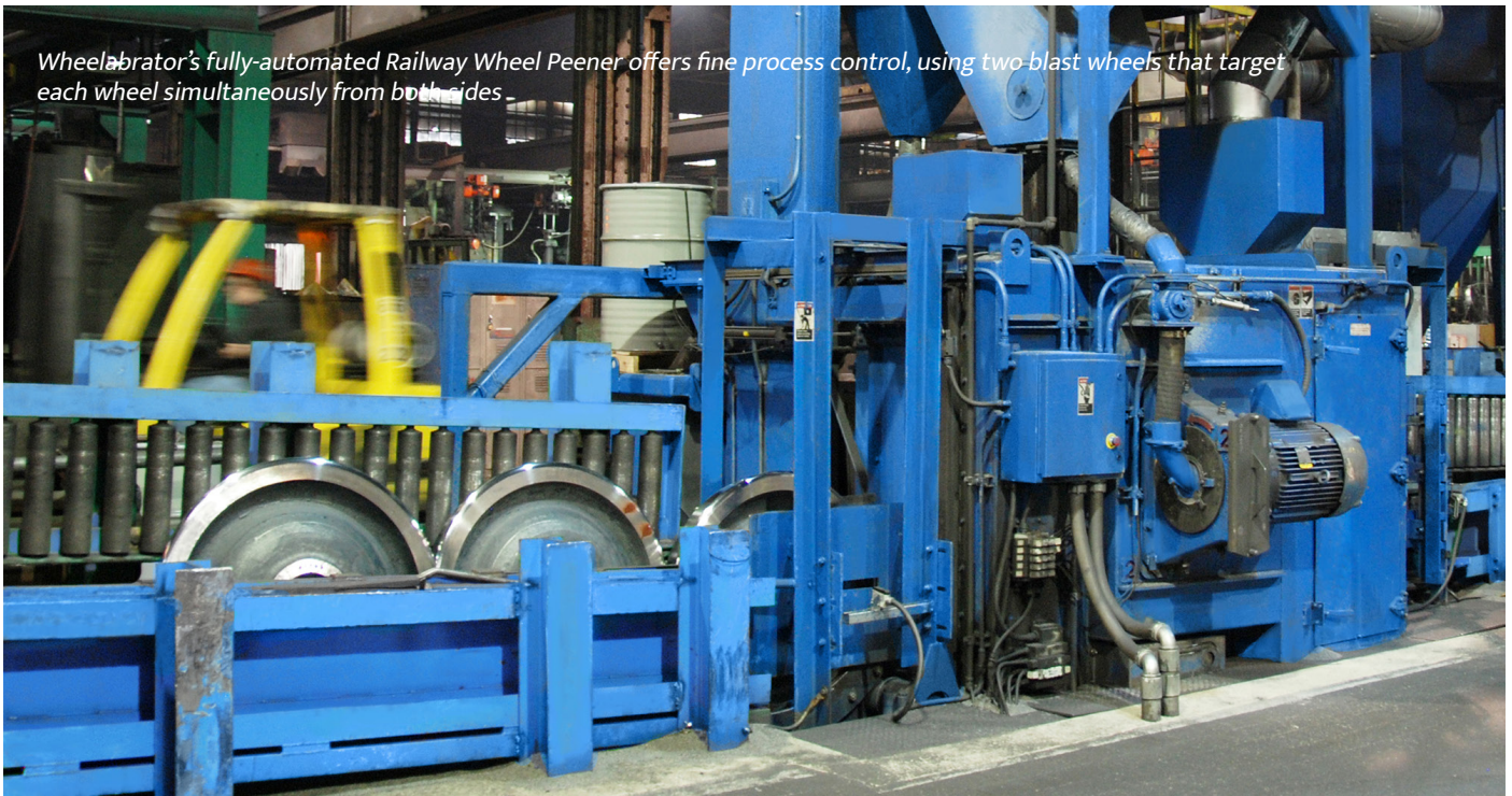
Wheelabrator's fully-automated Railway Wheel Peener offers fine process control, using two-blast wheels that target each wheel simultaneously from both sides.

deformation and induces a residual compressive stress in the peened surface.