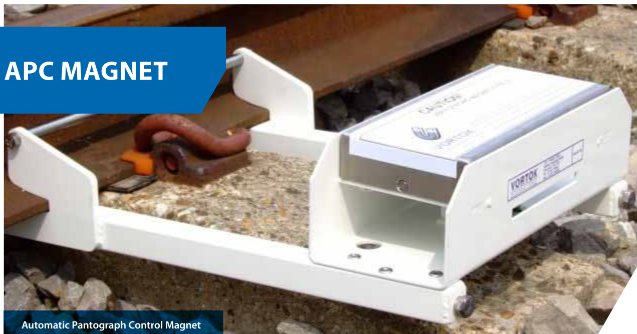
Automatic Pantograph Control Magnet