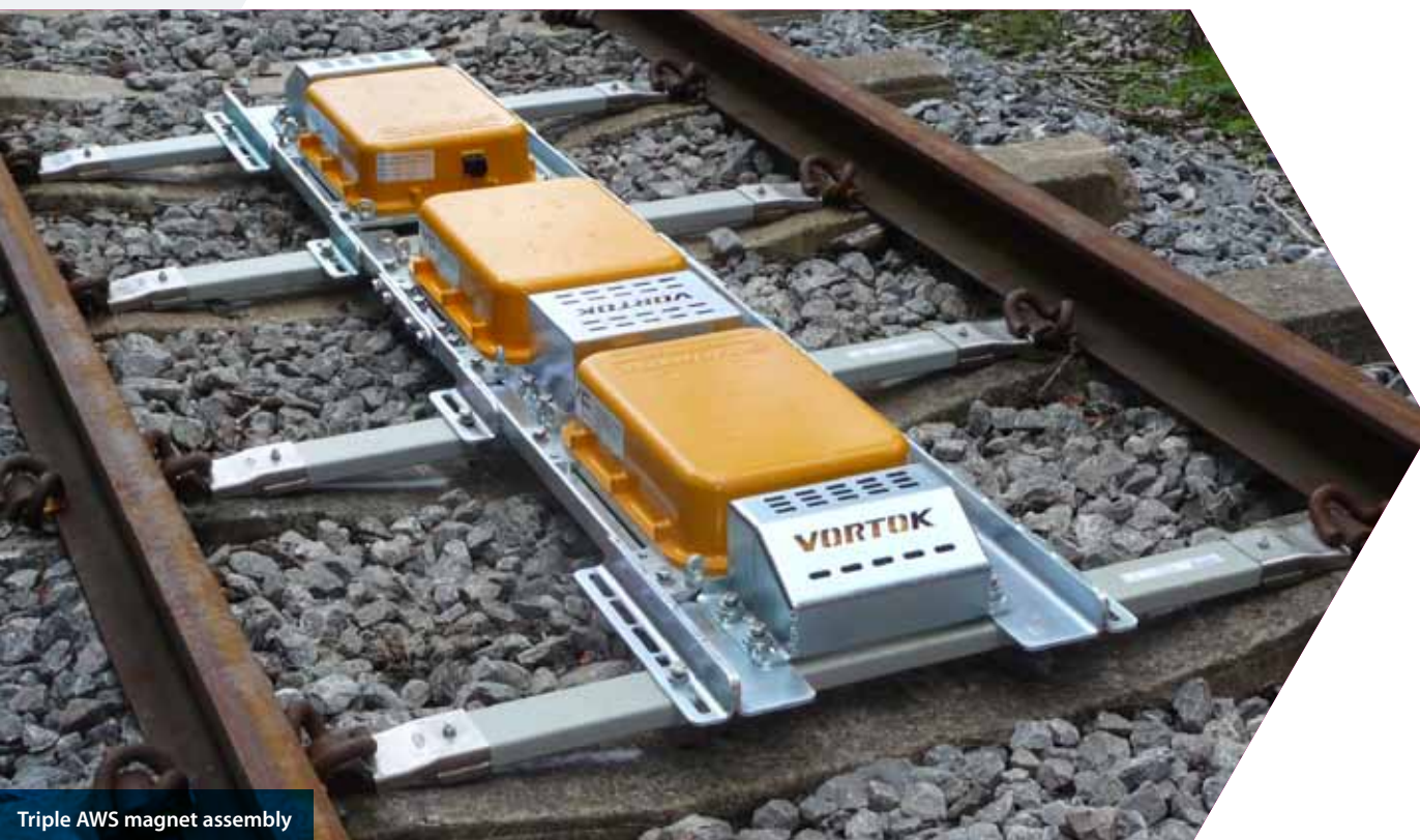
Triple AWS magnet assembly

References: UK, Thameslink, Crewe-Shrewsbury, GNGE.