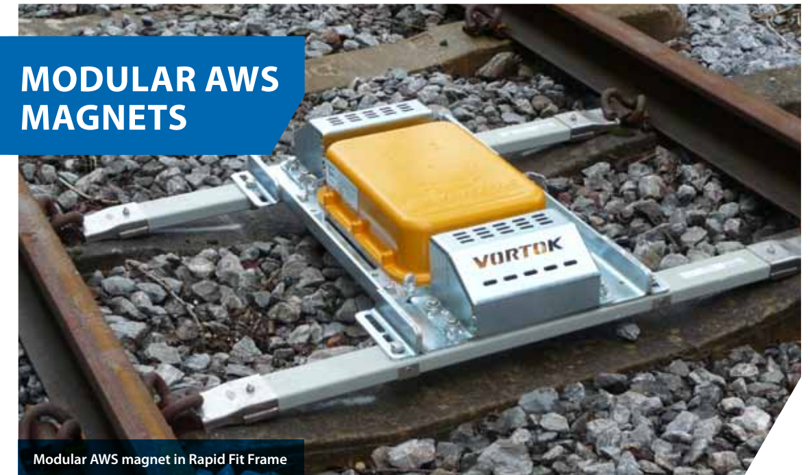
Modular AWS magnet in Rapid Fit Frame

The use of rare earth magnet technology has enabled a reduction in size, whilst improving performance compared to that of traditional magnets.