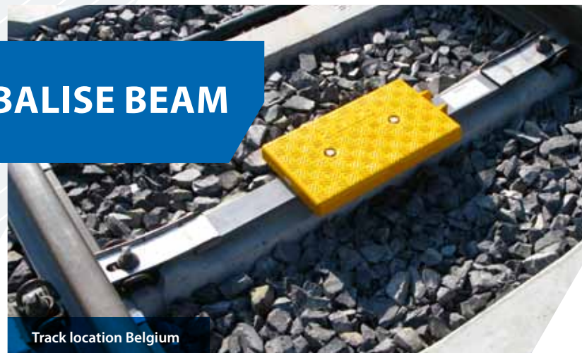
Track location Belgium

Originally designed for the installation of TPWS (Train Protection & Warning System) in the UK, the Balise Mount System (BMS) comprises a GRP beam with stainless steel yokes that use the existing rail fastenings or the rail foot to hold the beam in track. The BMS allows for very quick installation and removal of devices from track, typically taking less than 2 minutes.