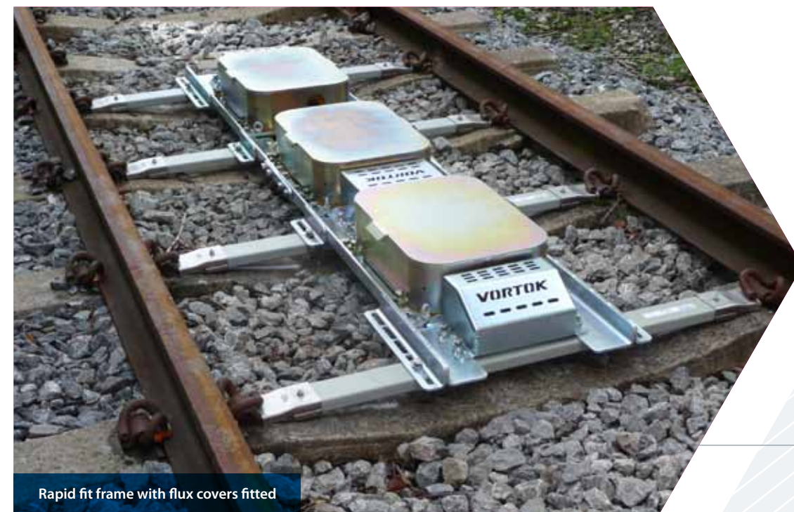
Rapid fit frame with flux covers fitted