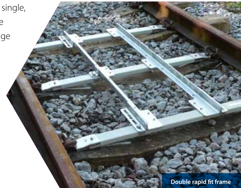
Double rapid fit frame