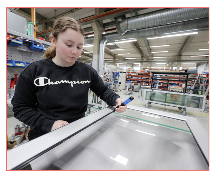
Polarteknik's employee installing a window seal frame