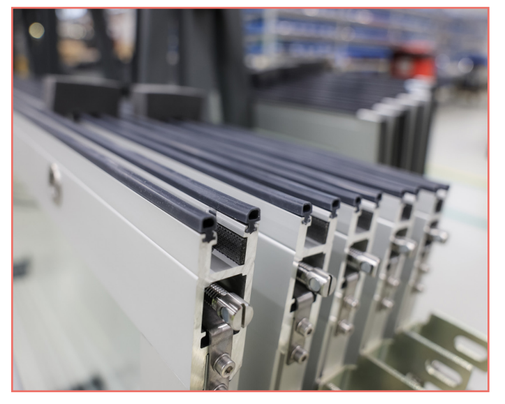
FinnProfiles supplies several different sealing materials and profiles to Polarteknik. All of them comply with the EN 45545-2 standard