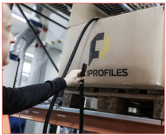
Polarteknik uses several kilometres of sealing material every year