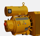
Good Option: G/GC Series