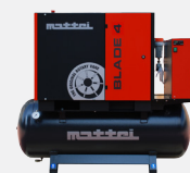
Better Option: BLADE Series