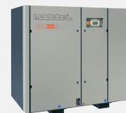
Better Option: AC Series