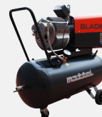
Best Option: Blade Series

Click here to learn more about the Blade Series and why and how these systems provide value to the healthcare industry.