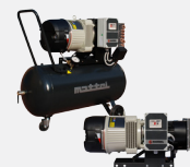
Better Option: ERC Series