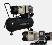
Good Option: ERC Series