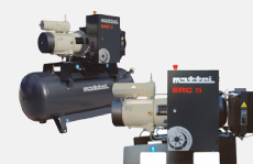
Good Option: ERC Series