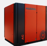
Better Option: AC Series