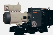
Good Option: ERC Series