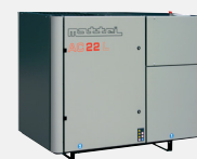
Best Option: AC Series

Click here to learn more about the AC Series and why this is the best system for body shops and automotive repairs.