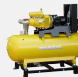
Better Option: EGC Series