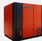
Better Option: AC Series