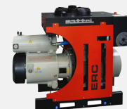
Good Option: ERC Series