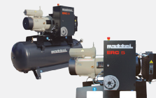
Good Option: ERC Series