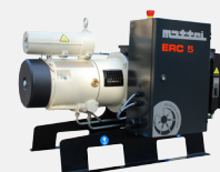
Good Option: ERC Series