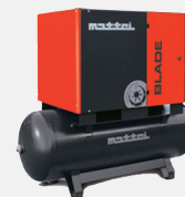
Better Option: BLADE Series