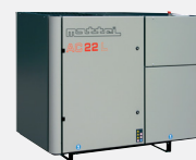
Best Option: AC Series

Click here to learn more about the AC Series and why this is the best system for the agriculture industry.