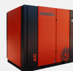
Better Option: AC Series