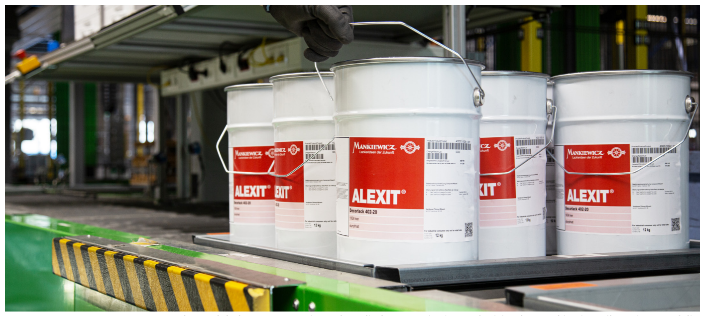
A robust, global setup means it can be relied on even in times of crisis: The Mankiewicz rail coating portfolio

Sure Thing: You Can Rely on Mankiewicz in Times of Crisis