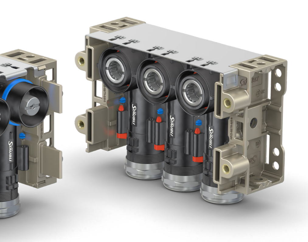
Modular power connector MPC – For use in rolling stock, e.g. on-board power applications, traction converter and battery outputs, body to bogie and motor connection

years. Disposing of them would be anything but ecologically sound. To date, around 60 percent of rail lines in Germany have been electrified. Not all lines are equipped with electric overhead lines. In the end, there are still thousands of kilometres of non-electrified lines. The solution: diesel railcars are being converted into modern hybrid vehicles that can then run on electricity. The EcoTrain, an initiative of DB Regio and DB RegioNetz Verkehrs GmbH, puts the concept into practice. Stäubli was also called in here as an experienced partner for the first prototype.