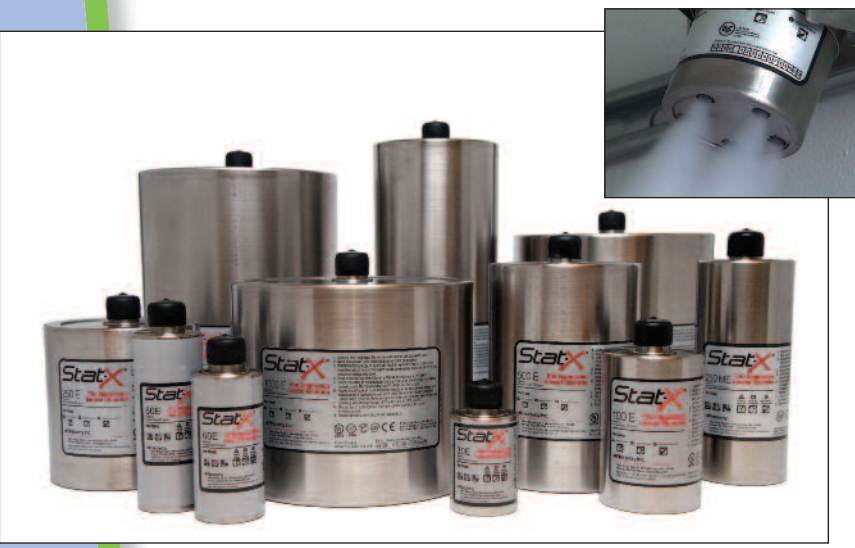
Stat-X® extinguishing units are compact and modular

Stat-X highly-advanced fire suppression technology offers the most compact and economical fire extinguishing solution available for the Rolling Stock industry. A Stat-X unit consists of an extremely rugged, hermetically sealed, stainless steel canister containing a stable, solid compound. The canister is durable and non-pressurized, and is capable of withstanding harsh, corrosive environments. In the event of a fire, Stat-X units automatically release ultra-fine particles and propellant inert gasses which quickly and effectively extinguish fires without depleting oxygen levels and with no negative impact on the environment.