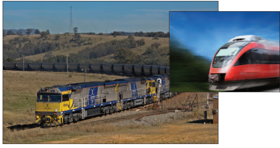
Stat-X<sup>®</sup> fire suppression system protects the engine and alternator cabs and the oil filter compartment.