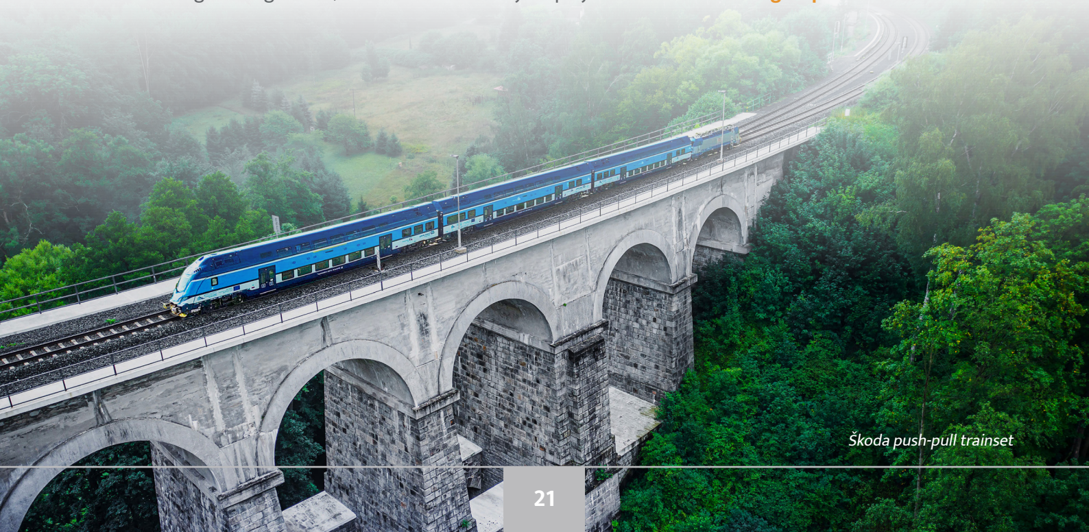
Škoda push-pull trainset

The complete portfolio of products and services can be found at skodagroup.com .