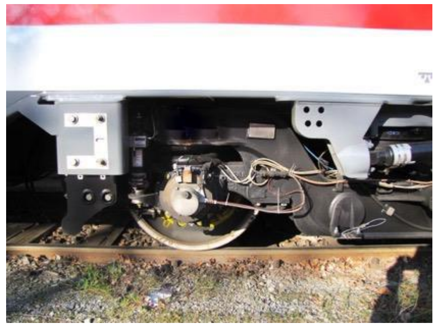
For the measurements, the ASC sensors are mounted on the wheelsets of the trains