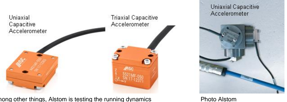
Among other things, Alstom is testing the running dynamics of the trains with ASC's capacitive accelerometers

Alstom thus received fully calibrated sensors of type ASC 4421<sup>1</sup> (uniaxial) and ASC 5521<sup>1</sup> (triaxial) made with special plug connectors and were able to use them for measurements straight away. Contrary to what you might think, they're only used to a small degree in Salzgitter itself. The reason for this is the applicable standards, which specify that the tests must be carried out on the public rail network. For these test runs, the company use certain sections of rail with very specific properties. "For the running dynamics tests, we traverse the section from Nuremberg to Augsburg and a section near Trier, as the arc radius of the tracks are narrow there, enabling us to easily test how the trains will behave on curves," explained Michatz. These sections are blocked for the duration of the test, as the trains travel 10 % faster than normal during the test runs, creating a risk of collision.