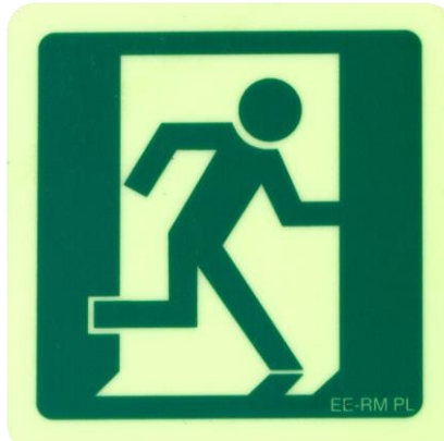
Double-Sided Running Man Photoluminescent (Grade C) Self-adhesive Decal