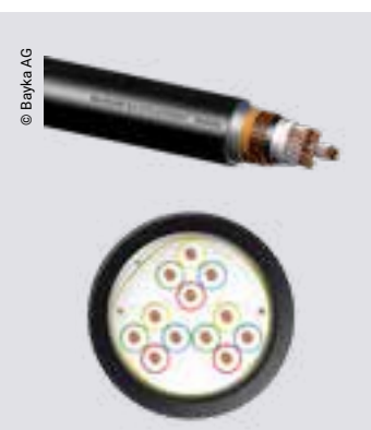
All common railway cable types can be monitored by the system - only the cablespecific parameters have to be stored.