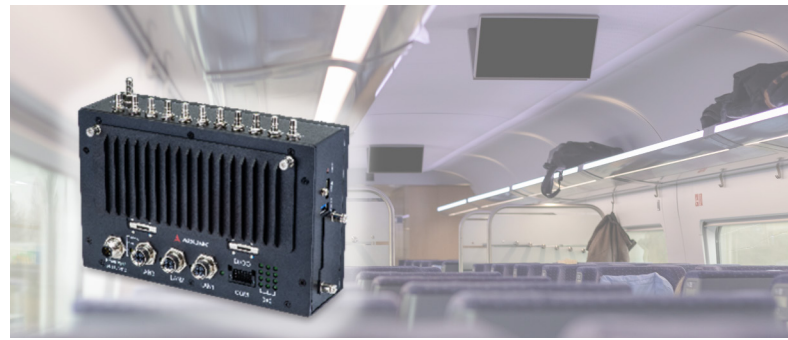
AVA-1000 for train-to-ground communication

On the other hand, ADLINK's AVA-1000 offers a seamless bridge between moving trains and ground networks, ensuring that passengers remain connected, informed and productive regardless of their physical location. The AVA-1000 is EN50155 certified with a fanless design and durability in extended temperature ranges (OT4, ST1), which ensures its reliability and performance in demanding environments.