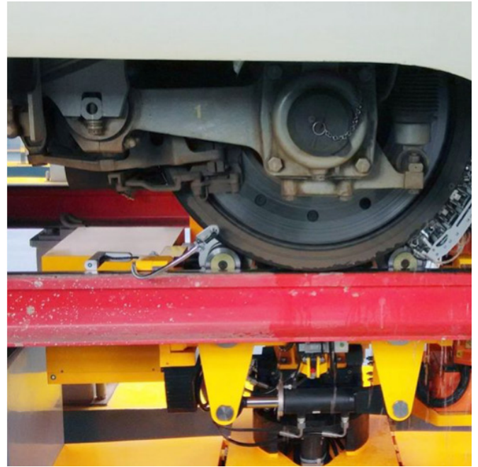
UW-UT system on a calibration reference wheelset (left) and an on-vehicle wheelset inspection (right)