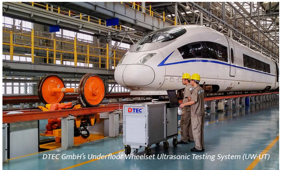
DTEC GmbH's Underfloor Wheelset Ultrasonic Testing System (UW-UT)

The WIS uses Olympus' FOCUS PX PAUT instrumentation to detect