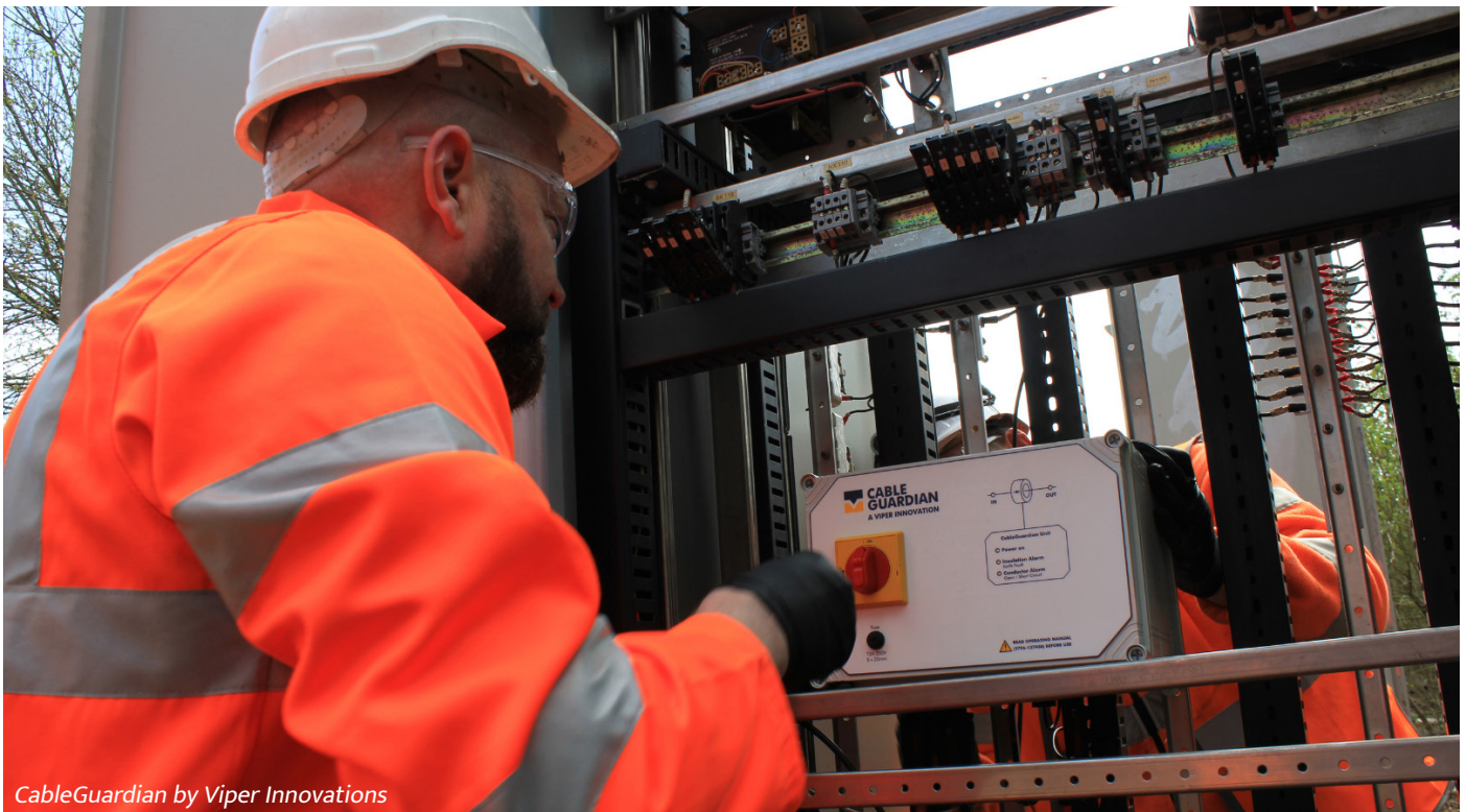
CableGuardian by Viper Innovations

Network Rail Region Utilises CableGuardian® Technology for Enhanced Insight and Monitoring of Its Signalling Power System