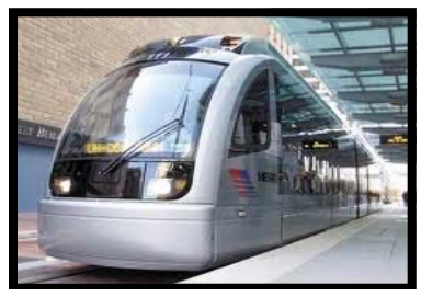
Siemens Industry Mobility