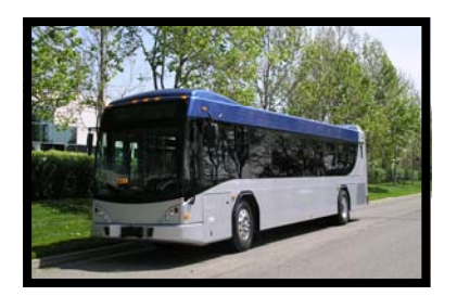
Transit Bus Floors