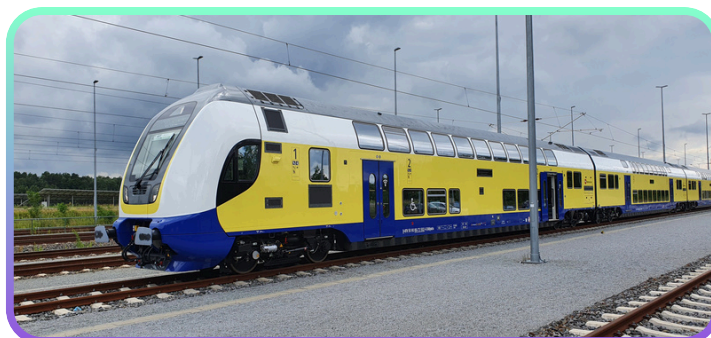
Transfer journey: The IGT in action

The company combines engineering expertise with operational experience: many of its employees are engineers, some of whom are also qualified as train drivers with additional technical and operational qualifications. Some of the engineers are also recognized as experts by the Federal Railway Authority.