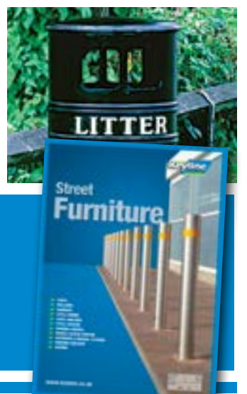
See our Street Furniture Guide for more information