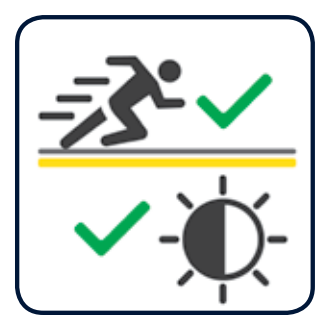
Unaffected by light sources or speed of passage