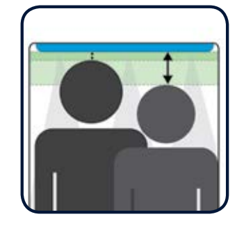
No minimum height required for installation.