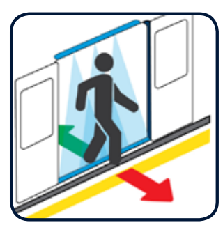
Sensors cover the entire door's width and are installed directly above the gap.